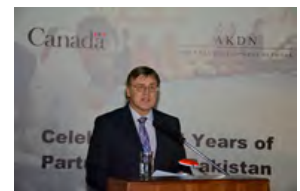
CANADIAN GOVERNMENT AND AKDN CELEBRATE 35 YEARS OF PARTNERSHIP P.5