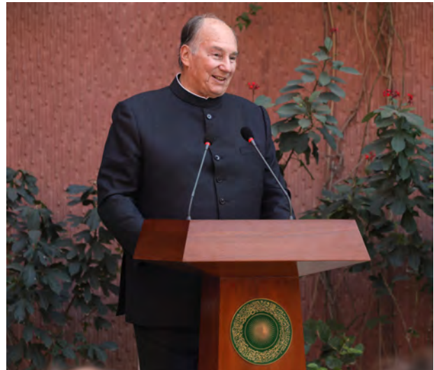
His Highness the Aga Khan delivering the inaugural address

His Highness laid the foundation stone for the three buildings of CIME during his previous visit to Pakistan in 2013.