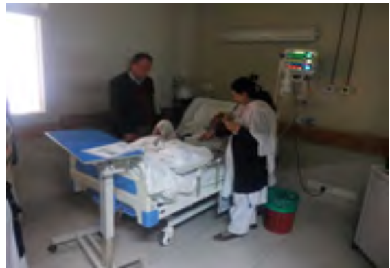
AKMC, G nurse providing treatment to a patient in the HDU

November 2017: A high dependency unit (HDU) was established in the Aga Khan Medical Centre, Gilgit, (AKMC, G) with the support of the Global Affairs Canada-funded Central Asia Health System Strengthening (CAHSS) project. CAHSS provided capacity building of nurses and provision of monitoring equipment to ensure quality care and vigilant monitoring of critical patients. The establishment of the HDU and capacity building of the nurses in AKMC, G has resulted in the recovery of many critical patients.