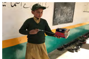
MEET THE YOUNG INNOVATORS FROM CHITRAL P.3