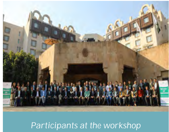
Participants at the workshop

8 January 2018: The Aga Khan Agency for Habitat, Pakistan (AKAH, P) held an international planning workshop in Islamabad on 8th and 9th January, 2018 to design comprehensive, community-centric programmes for reducing the disaster risk vulnerability of communities situated in hazard-prone areas in Gilgit-Baltistan and Chitral. The workshop was organised in light of the challenges posed by climate change to human lives and public and private infrastructure, particularly for the communities living in the mountainous regions of northern Pakistan which have prompted civil society actors to not only respond to the frequently occurring disasters but also to build sustainable mechanisms for improved preparedness and adaptation against future disaster risks. The workshop was attended by over 70 international and national stakeholders including representatives from AKAH's Global Office, AKAH's Regional Offices in Tajikistan and Afghanistan, AKDN agencies in Pakistan (Aga Khan Foundation, Aga Khan Rural Support Programme, and Aga Khan Culture Services), financial institutions (First MicroFinanceBank Ltd and Habib Bank Limited), academic institutions (Punjab University and NED University of Engineering and Technology), community representatives and civil society actors.