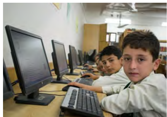
Internet via Satellite at a school in Chatorkand, GB

Aga Khan Education Service, Pakistan (AKES, P) has provided eight schools in Gilgit-Baltistan with Internet via Satellite (IVS), connecting more than 4,000 students and teachers with valuable educational resources available online. A Regional School Development Unit in Gilgit-Batistan, which previously did not have internet connectivity, has also been provided with IVS, enabling it to stay connected with regional and central offices. In addition, two schools in Chitral and three in Sindh were provided with mobile computer labs, which are essentially trollies stocked with tablets. As a result,