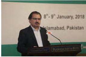
AKAH, P ORGANISES WORKSHOP ON DISASTER RISK REDUCTION P.3