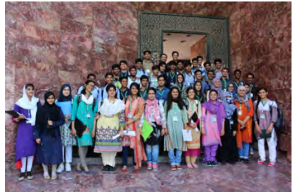
Participants at AKU's Challenge Scholarship Programme