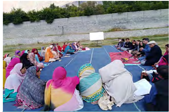
Members of LSO, VO and WO in Sherqilla, Ghizer meeting with Shoaib Sultan Khan and senior AKRSP staff

sources of social capital which can be substantially increased by the government with investments in the development of these local communities. He said it was crucial for the communities to organise themselves into Village Organisations (VO), Women Organisations (WO) and Local Support Organisations (LSO) in order to work with the government to ensure that development efforts have a positive impact at the household level. He advised AKRSP to help VO's and WO's to spend their institutions savings through LSO's. Additionally he also emphasised the need for having Union Council level plans, micro development plans and a revolving fund plan. The meeting with members of community organisations and government officials should pave the way for creating new partnerships for the development of the region. He was very pleased that communities have almost over 2.5 billion PKR savings in VO/WOs. He emphasised on women taking lead and forming women organisations. He shared his experience from India and Pakistan for poverty reduction and emphasised on the fact that women leadership is critical and important for development.