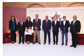
SERENA CELEBRATES 70TH INDEPENDENCE ANNIVERSARY OF PAKISTAN P.4