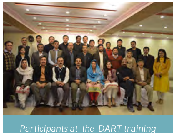
Participants at the DART training

26 December 2017: The Aga Khan Agency for Habitat, Pakistan (AKAH, P), in collaboration with the United Nations Office for the Coordination of Humanitarian Affairs (UNOCHA), held a three day training session for its Disaster Assessment and Response Team (DART) from the 26th to 28th December 2017 in Islamabad. DART is part of AKAH, P's Emergency Management Department, which oversees a number of programmes on disaster preparedness, response and capacity building of communities. In order to build the capacity of DART, it was revitalised with the inclusion of new members from AKDN agencies and the Government.